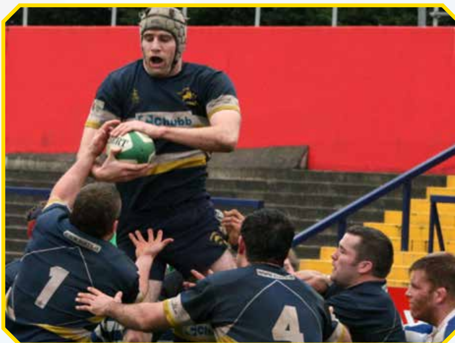
Seniors v Dungannon - who can you recognise