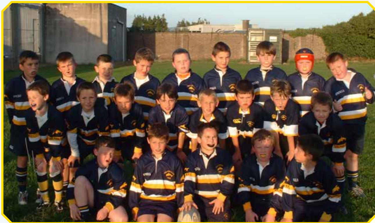
Under 8's & 9's