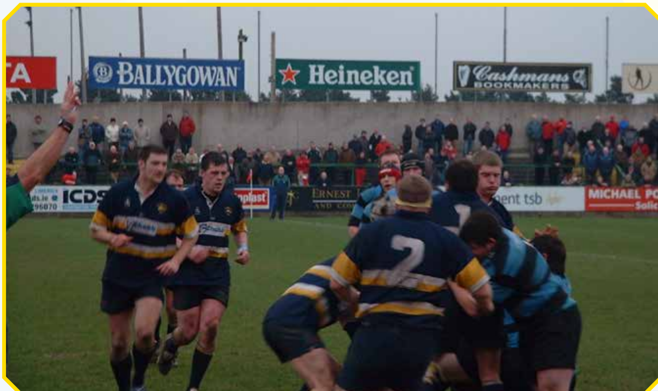
Seniors v Shannon- who can you recognise