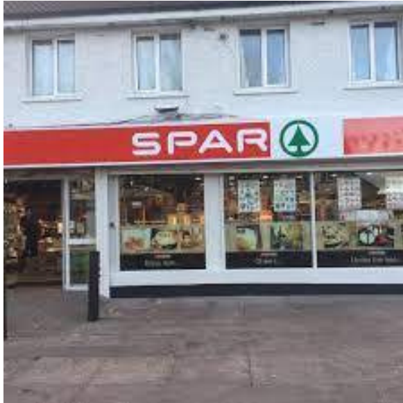
Pearse Square, Ballyphehane.